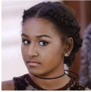
Sasha Obama Sets the Internet on Fire With Unlikely Snap