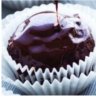
Chocolate Macaroon Birthday Cupcakes