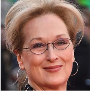
Robert De Niro Responds to Meryl Streep Speech