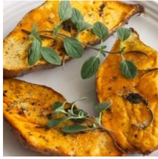
How To Bake The Perfect Sweet Potato Every Time