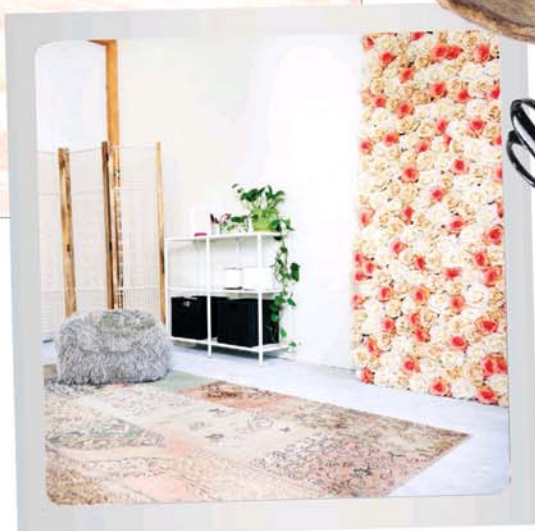
Folded In: Firm's dedicated space for fittings and yoga.