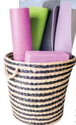
Yoga mats: A yoga instructor comes to the office twice a week to host classes for the staff.