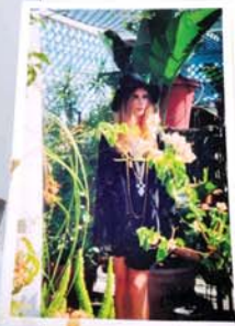
Photo: An image from the company's first photo shoot.